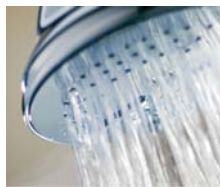
Efficient tankless electric water heaters