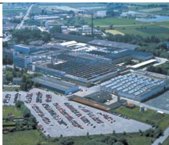
Stiebel Eltron's plant in Holzminden, Germany.

Stiebel Eltron has been a world leader in the development of advanced water heating technology for over 80 years. Our pursuit of engineering excellence and high-quality manufacturing results in products fulfilling the highest expectations of performance and reliability. They are... Simply the Best.