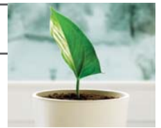
Highest ENERGY STAR rated air-source heat pump water heater