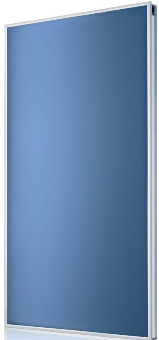
SOL 27 Premium S (standard)