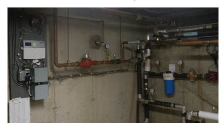
The controller and datalogger control the operation and monitor critical components of the system.