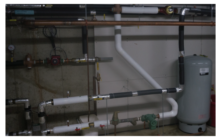
The mechanical room houses the solar thermal components except for the thermal mass storage tank, which is on the other side of the pictured wall.