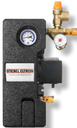
Flowstar Pump Station

Pump Station | Stiebel Eltron Pump Stations are specially designed for closed loop solar systems. The 3-speed Wilo circulator pump is designed to perfectly integrate with our SOM 6 Plus controller. Pump station piping is high grade brass. Pump stations come preassembled with a steel wall mounting bracket and feature 2 drain valves, brass check valves to prevent thermo-siphoning, integrated flow meter, and include fittings for tank mount as well as NPT adapters. The pump station can be completely isolated from the system, so no draining is necessary during servicing.