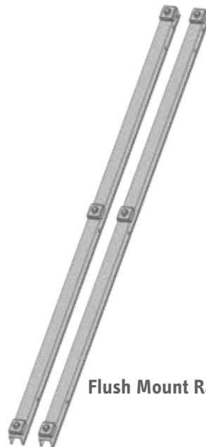
Flush Mount Rail System