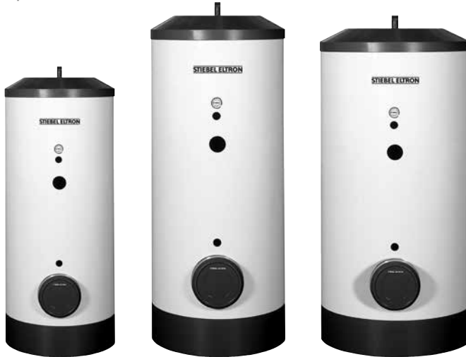
Left to right: SBB 300 SBB 400 SBB 600 Plus