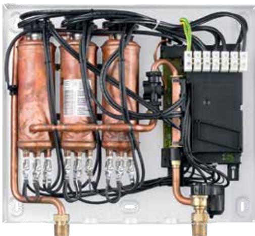
Tempra® 29 & 36 Plus, open